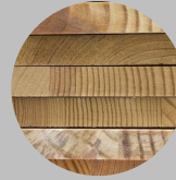
Building & Wood Products