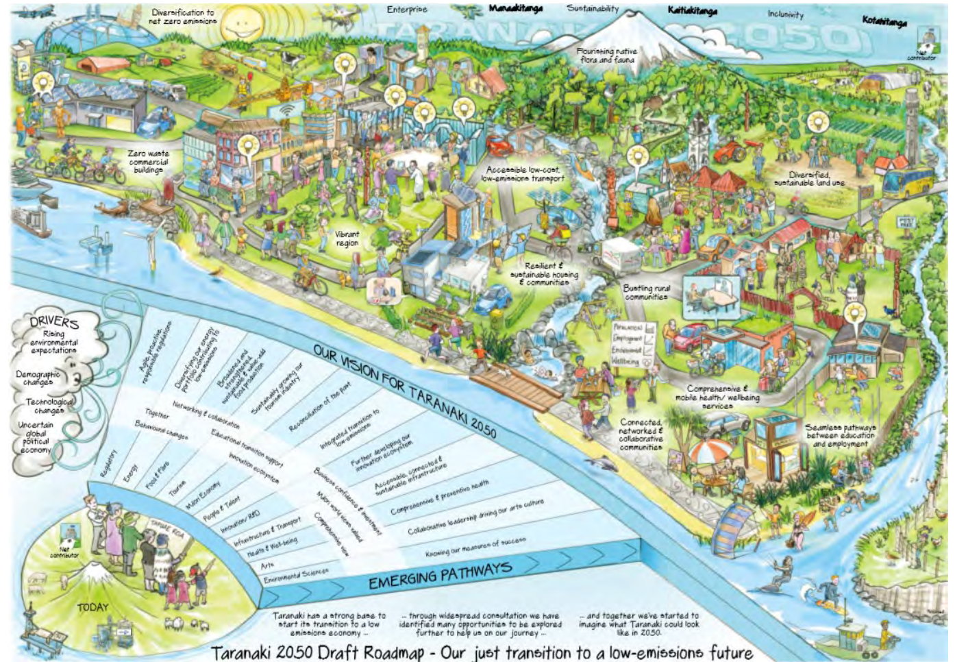
Taranaki 2050 Draft Roadmap - Our just transition to a low-emissions future